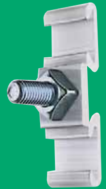
D51089 Mounting Plate