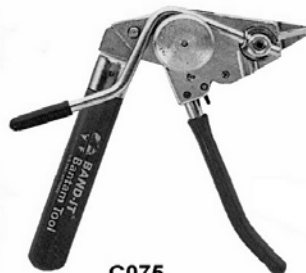
C075 BANTAM Tool