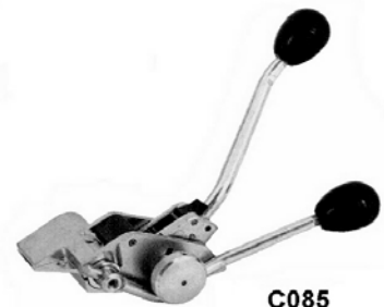
C085 BANTAM STRAPPING Tool