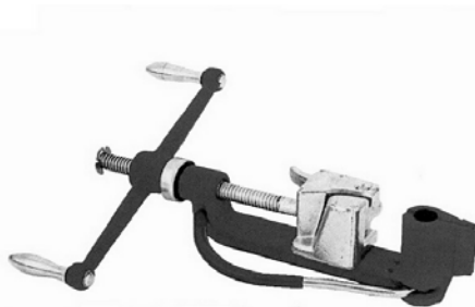
C001 BAND-IT Tool

Extra light duty Wing-Seal Clips and Crimp-Seal Clips available on request