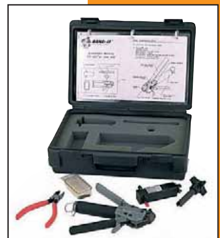
A49099 Tie-Dex® II Kit

Weight: 4.6 Lbs (2.0 Kg). Kit includes: 1-A30199, 1-A47599, 1-A44699, parts and cutters.