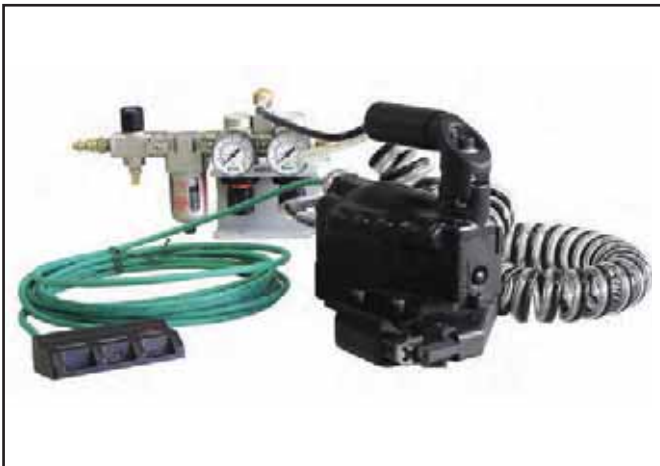
IT Series Tools