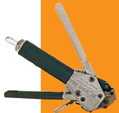
A40199 Tie-Dex® II Tool

Precalibrated tool applies Tie-Dex® Micro Bands. Weight: 1.3 Lbs (0.6 Kg). Use the Calibration Key (A44699) to change calibration.