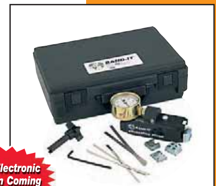
A50099 Tie-Dex® Calibration Kit

50 test bands. Weight: 0.1 Lbs (0.06 Kg).