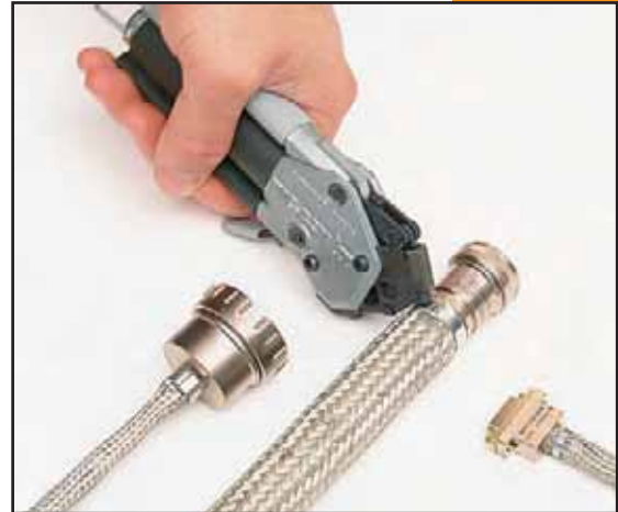
A40199 Tie-Dex® II Tool