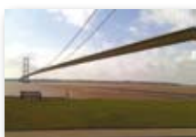
Tunnels & Bridges