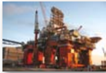
Petrochem (Offshore & Onshore)

Fire hazards... corrosive environments... temperature extremes... for many applications, plastic cable ties and identification tags are simply inadequate – or even dangerous.