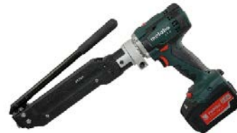
UL4000-D 18 Volt Rechargeable Cordless Tool