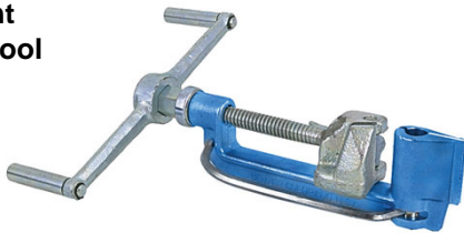
G402 Giant BAND-IT® Tool