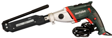
UL9010 Ultra Lok Tool