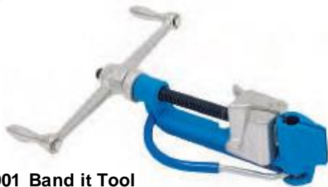
C001 Band it Tool