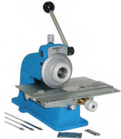
ID 200 ID Tag Imprinter Tool