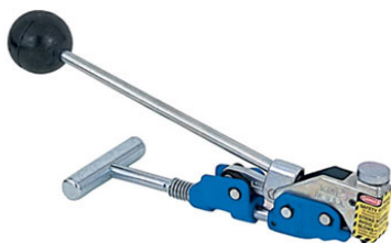
T300 Centre Punch Tool