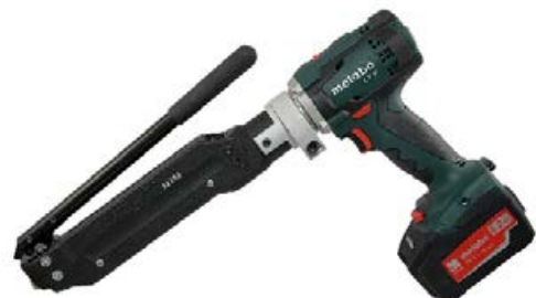
Band-It UL4000-D 18 Volt Rechargeable Cordless Tool