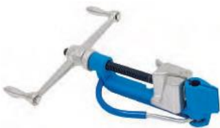
C001 Band it Tool

The BAND-IT® 316 Stainless Steel Band-It straps provides superior corrosion resistance in fresh water and typical atmospheres and is non-magnetic. Ideal for food process, chemical / agricultural hose assemblies, marine splash zones and some acidic environments.