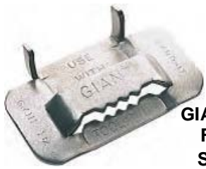
GIANT Ear- Lok Buckles For BAND-IT® Giant Stainless Steel Band

Giant Band produces the strongest band clamp on the market. Giant Band can be formed into a single or double wrapped clamp configuration and offers the widest and thickest band to provide maximum strength. The 201 Stainless steel offers good resistance to oxidation and many moderate corrosive agents.