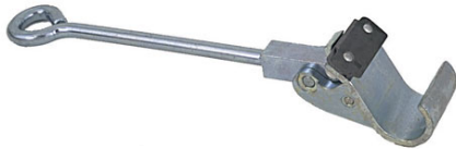
J001 Adapter Recommended for band widths less than 10mm