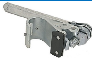
J050 Heavy Duty Adapter Recommended for band widths greater than 13mm