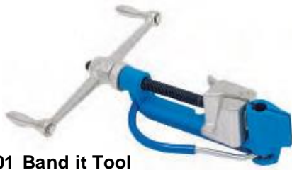
C001 Band it Tool

Click on the image to save or open the instruction manuals: