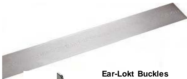
Ear-Lokt Buckles In various widths For BAND-IT® 201 Stainless Steel Bands.